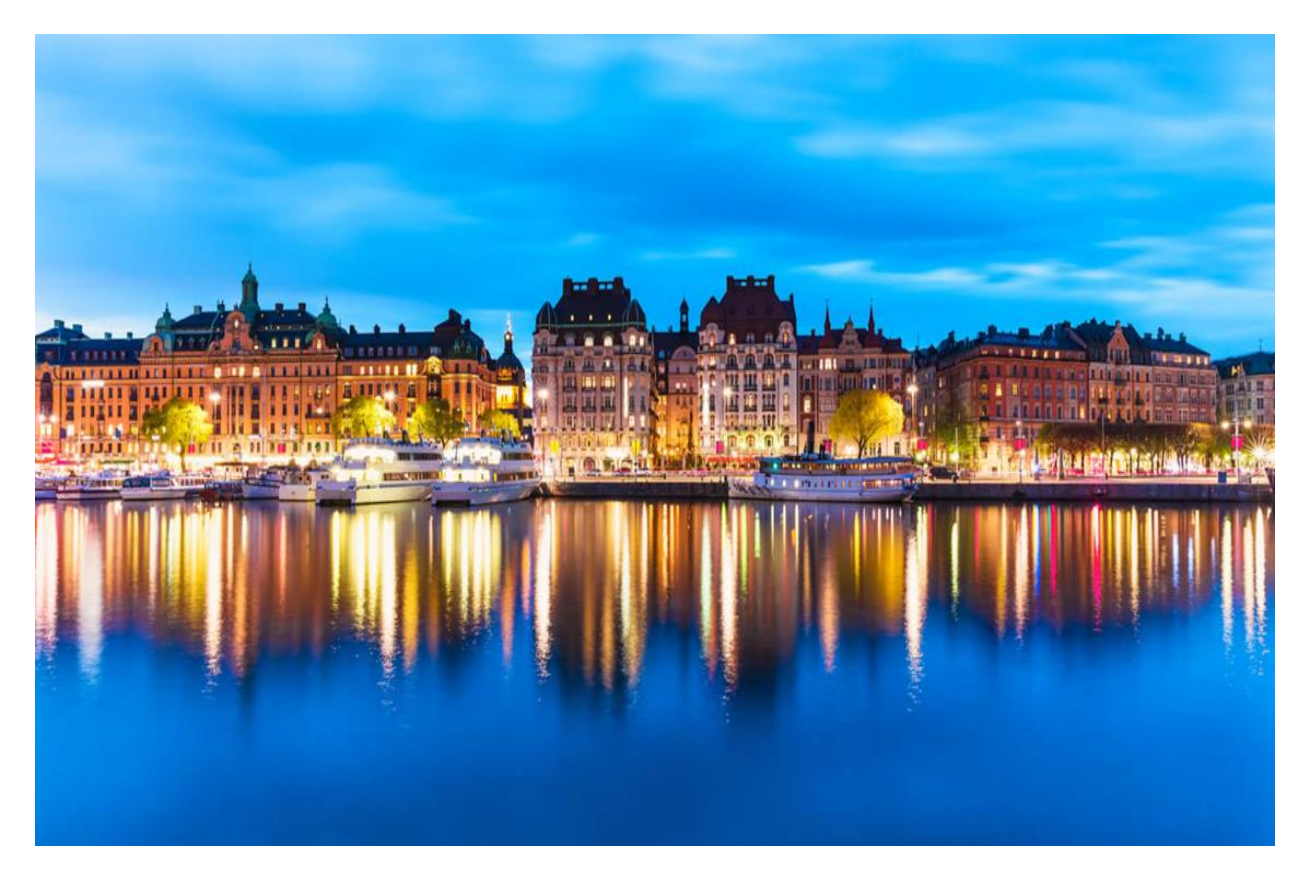
Labour law: Prolonged recommendations

Employers who have the opportunity to let their employees work from home should recommend this. This recommendation is prolonged until at least end of May.