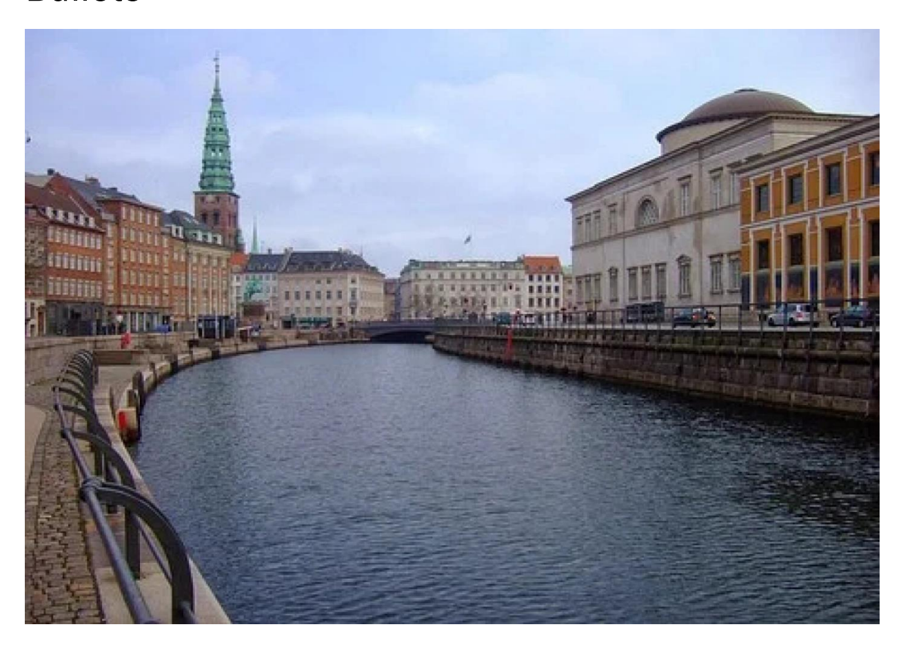
Societal initiatives as a result of Covid-19

Aid packages available in Denmark as a result of Covid-19: a) The extension of aid packages means that we as auditors have fewer free resources; b) The application deadline for Salary and fixed costs compensation have been postponed to April 2021; c) At the moment, there is no clarification in regard to the possible extension of aid packages in Denmark which currently expire on 28 February 2021.