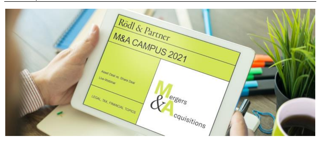
#1 Webinar | M&A Campus, 3 February 2021.

Rödl & Partner has commenced a session of webinars titled <u>M&A Campus 2021</u> that is dedicated to a wide range of M&A-related topics. Our highly experienced professionals from various jurisdictions will be sharing their M&A expertise and practical tips.