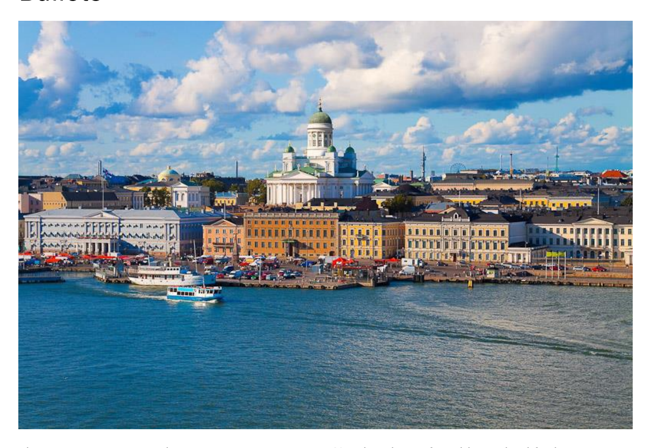
The economy is expected to grow in 2021

Finland's economy shrank less than was originally expected in 2020, and the economy is expected to grow in 2021. Vaccinations for Covid-19 are well underway, which is giving a boost to the economy and hope for businesses, such as restaurants, to return back to (new) normal, even if at the time of writing this, Finland is planning to impose partial lock-down measures in certain parts of the country.